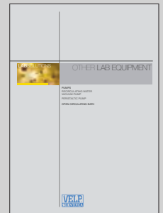
OTHER LAB EQUIPMENT

Constant Commitment to Knowledge Development